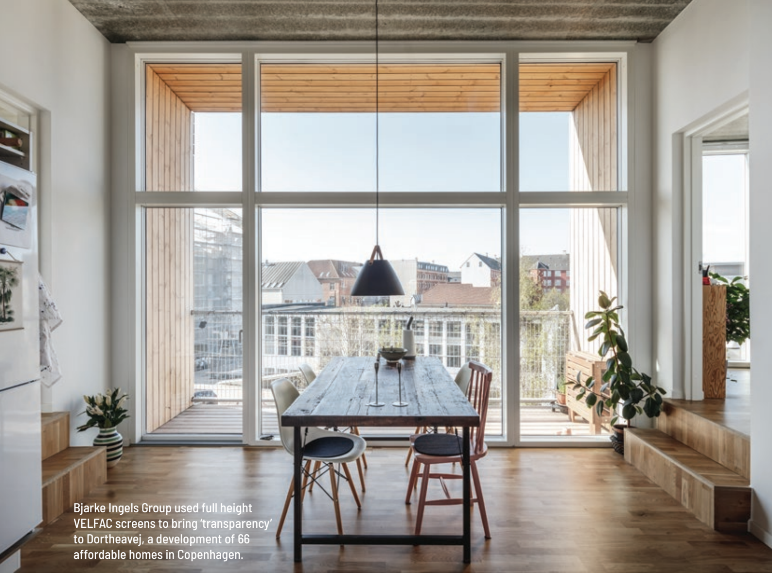
Bjarke Ingels Group used full height VELFAC screens to bring 'transparency' to Dortheavej, a development of 66 affordable homes in Copenhagen.