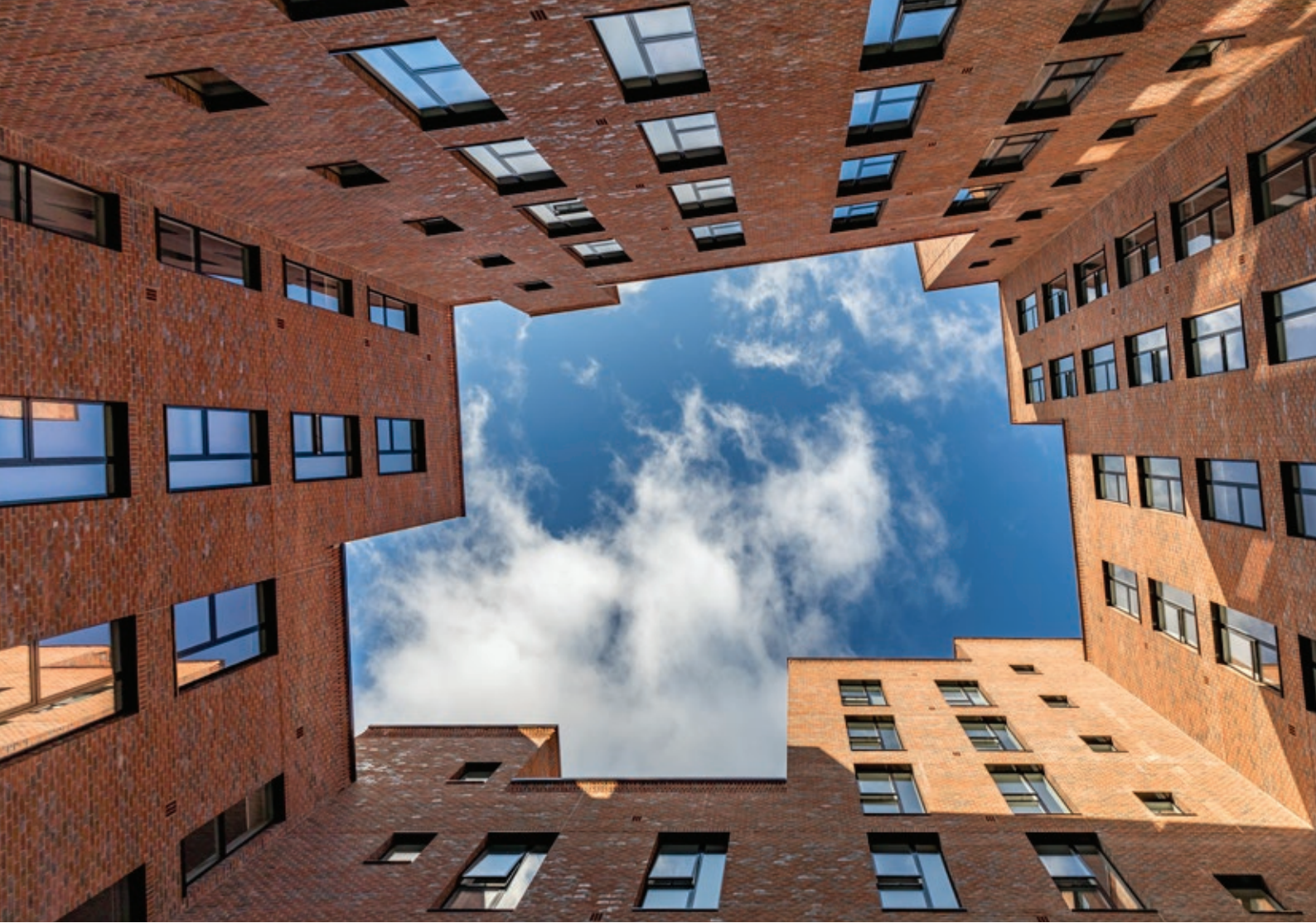
Dalston Lane in London, by Waugh Thistleton Architects - one of the world's tallest CLT buildings with VELFAC windows specified for performance, design and sustainability.